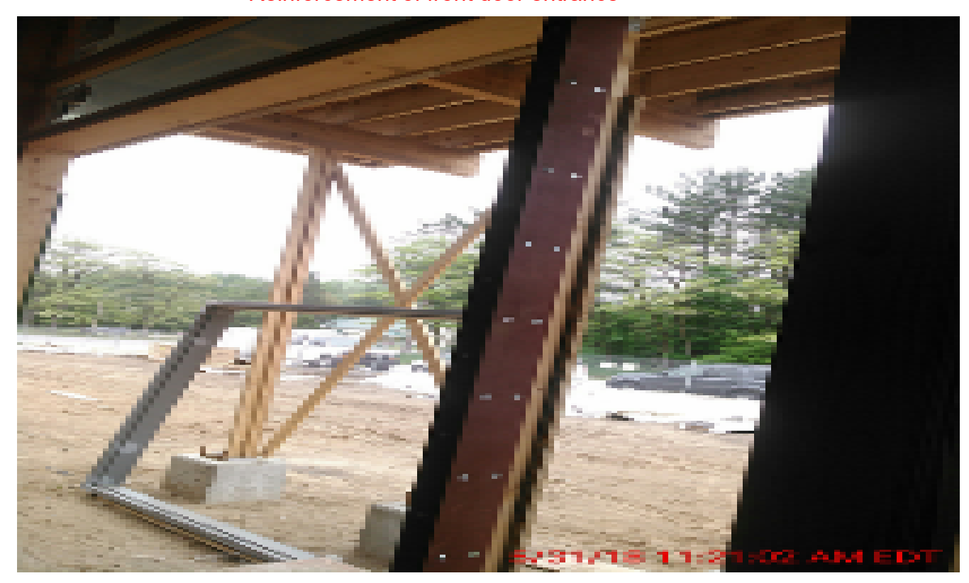
Set new column