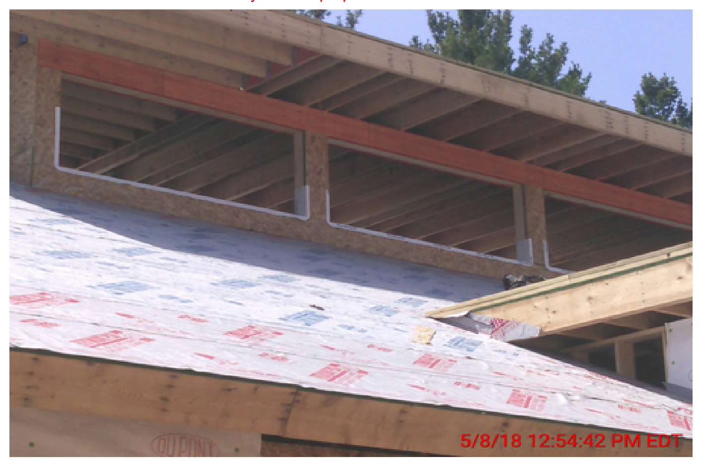
Installation of Clerestory windows